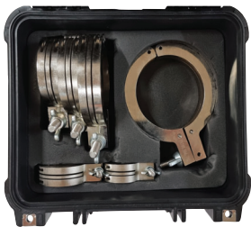
TSGPKIT1-4 Saw guide kit pipe 1-4" (25 - 100 mm)