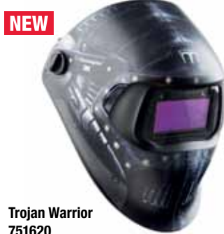
Trojan Warrior 751620