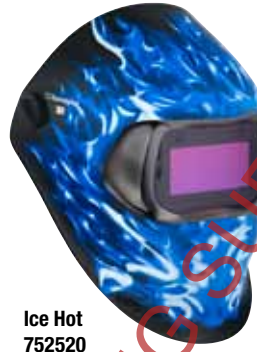
Ice Hot 752520