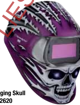
Raging Skull 752620