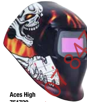
Aces High 751720