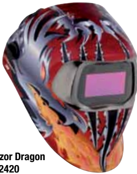
Razor Dragon 752420